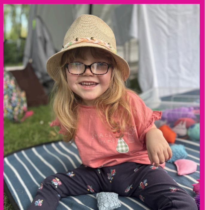
Photo taken at our stall at the Creative Revolution Event in Staveley

One Saturday each month we host a sensory session at the Fairplay Centre where families can access sensory activities and our sensory room.